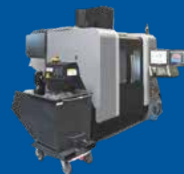
Container for chips